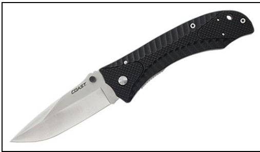
DX345 Full-Edge Satin Finish Knife

Built to last, and covered by the COAST limited lifetime warranty, new COAST knives feature high-carbon stainless steel blades that are sharp, tough and corrosion resistant. The open-frame design decreases weight and makes cleaning easy. Depending on the knife's design and purpose, users can choose from a variety of handle materials. Lightweight, yet strong aluminum handles on the DX321 and DX320 provide a perfect hand grip and G10 handles on DX350 and DX345 versions include a steel support in the middle which results in greatly increased strength and durability. Available in a variety of styles, the blade-assist knives have either a full-edge stain/glass-beaded finish or a black blade that's partially serrated (see examples below).