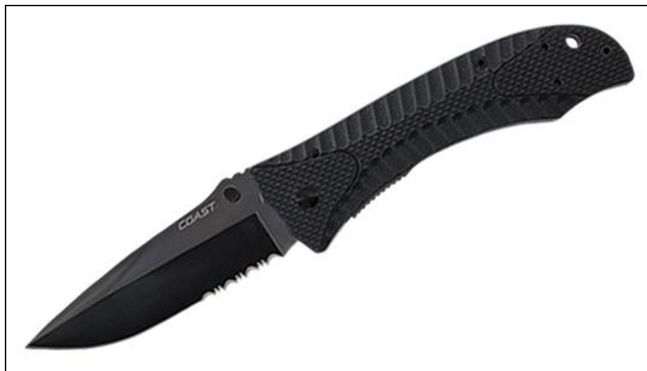
New 3.5-Inch DX350 Folding Knife

COAST will also be exhibiting a wide array of other new knives as well as flashlights, headlamps, lanterns and multi-tools. Their products offer advanced quality and innovation, the latest patented and proprietary features and technology, and are perfect for every professional, DIYer, retailer and distributor in the hardware and home improvement industry.