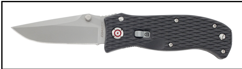
Rapid Response RX311 Full-Edge, Satin Finish Knife

Most important, the Rapid Response blade is finely crafted from stainless steel that's rigorously tested to ensure top-quality heat treatment. Each blade is tested for sharpness. They have ambidextrous thumb studs and pocket clips that are easily reversed to the other side of the handle or removed.