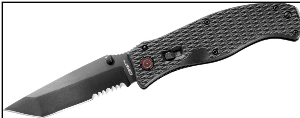
New 3.9-Inch Tanto-Style RX322 Rapid Response Knife

The complete line of outstanding Rapid Response knives will be on display during the Shooting, Hunting and Outdoor Trade ( SHOT ) Show – at Booth #15120 from January 15-18 in the Las Vegas Sands Expo & Convention Center. COAST will also be exhibiting a wide array of new flashlights, lanterns, headlamps and multi-tools. Their products offer advanced quality and innovation, the latest patented and proprietary features and technology, and are perfect for every professional, retailer or distributor in the sports and leisure industry.